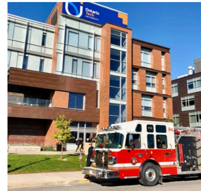
OntarioTech University is a partner of the Augsburg University of Applied Sciences. Students from Augsburg regularly spend their semester abroad at its Faculty of Business and Information Technology at the newly built campus in Oshawa, a suburb of Toronto.