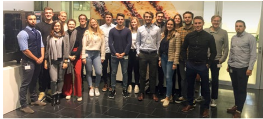
The guests at Rational AG in Landsberg am Lech.

In the context of the lecture series Entrepreneurship, Innovation & Technology Management (EI™), Rational AG, a hidden champion with strong roots in the region and global market leader in thermal food preparation, invited the students to visit in Landsberg am Lech.