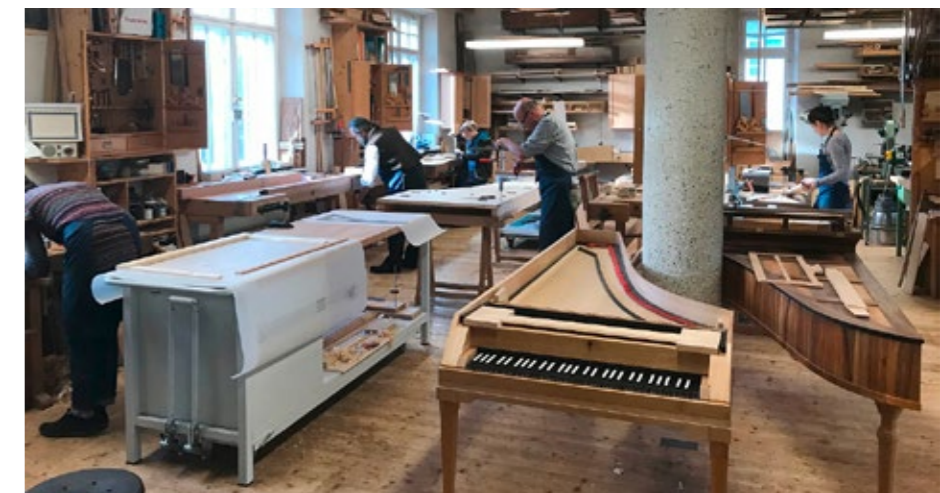
The workshop at the Greifenberg Institute of Organology.