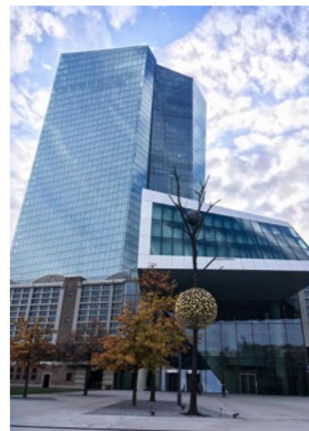
The impressive European Central Bank building.