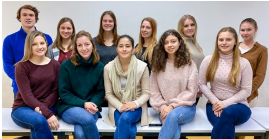
The team of the non-profit marketing project "SkF".

Women are often particularly badly affected by poverty, unemployment and difficult conditions. For this reason, the Catholic Women's Welfare Service (SkF), which now has around 160 full-time and 140 voluntary helpers, has been advising and supporting people in need, regardless of their ideology, nationality or religion, since 1912. The SkF runs, for example, advisory centers, child-care facilities, women's shelters and a retirement home. It is an association with members, sponsors, a board of management and a business office.