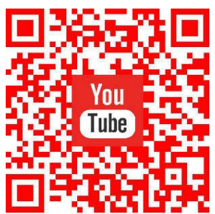
See what past Incoming students think about their experience at our University!