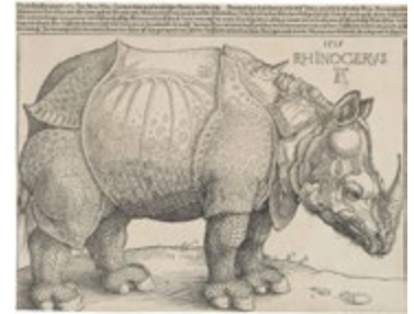
[1] Albrecht Dürer: Rhinoceros, 1515

"The sky is filled with stars, invisible by day." Henry W. Longfellow