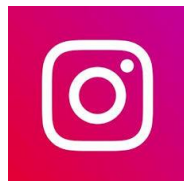
Instagram Computer Science