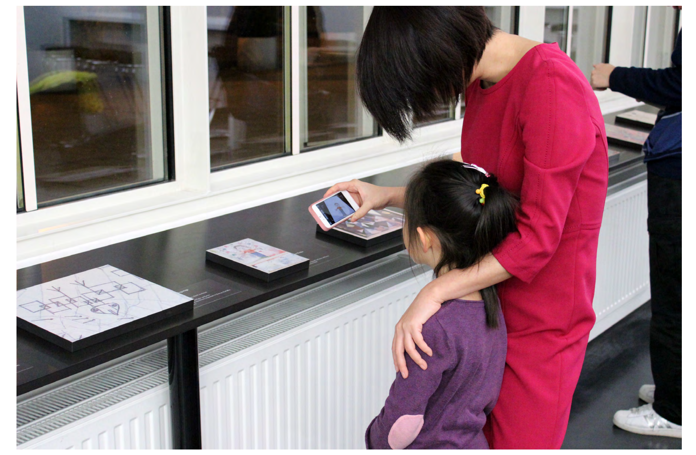
Regardless of age the app can be used by everyone